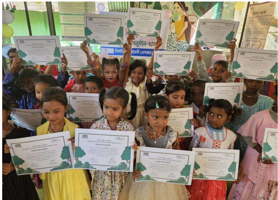
Below: Children with their leaving certificates

Chairman Treasurer Patrons: Web Site: On-line donations: