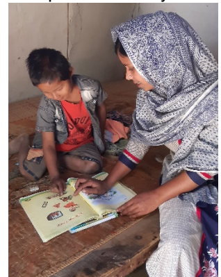
Milai receives tuition at home

Milai's family have no tube well. They fetch water from a tank- about 15 minutes' walk away.